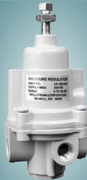
Type 40 Pressure Regulator Series